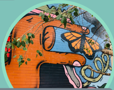
Public Library Mural