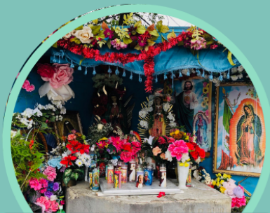
Our Lady Guadalupe Shrine