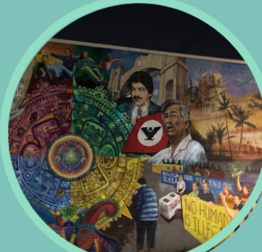
Oral History Mural