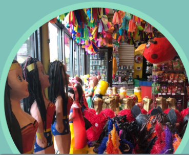
26th Street Shops