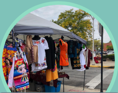
26th Street Market