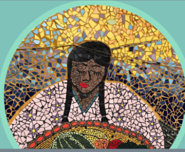
the Mosaic Wall