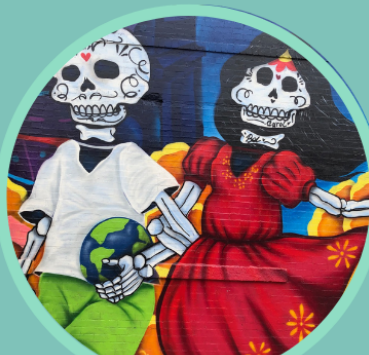
Nuevo Leon Mural